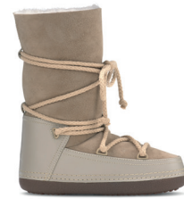
Classic High Boots Different colors available

Platforms, Low-Shafts, High-Shafts, and much more.