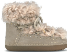
Long Curly Boots Different colors available