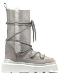
Endurance Cozy High Different colors available

New interpretation of a classic: Introducing the newly developed sole named Endurance. Chunky yet light, bold yet multifunctional. With this enduring winter beauty, everyone will experience maximum grip, maximum comfort and maximum style — all in one.