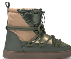
Puffer Sneakers Different colors available