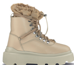
Endurance Hike Different colors available