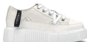
Matilda Leather Low Different colors available