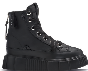
Matilda Leather High Different colors available