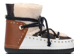
Curly Rock Boots Different colors available

More styles and colors — see Virtual Showroom.