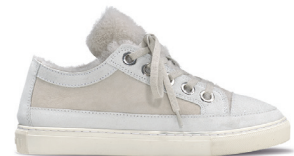
Lace Up Shearling Different colors available