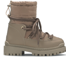
Performance Bomber Boots Different colors available