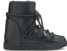
Full Leather Sneakers (4cm Wedge) Different colors available