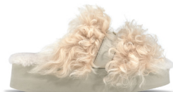
Tigrado Platform Slide

More styles and colors — see Virtual Showroom.