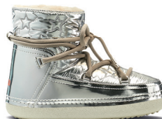
Bomber Star Boots Different colors available