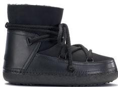
Classic Boots Different colors available

The original iconic boot that started it all and became a winter fashion essential. This classic boot keeps everyone's feet warm, dry, steady and in line with its anti-slip rubber sole. The perfect timeless style for cold and wet days, crafted by hand with premium materials.