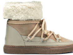
High-Shaft Sneakers Different colors available