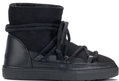
Shearling Sneakers Collection