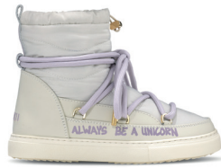
Puffer Print Sneakers Different colors available