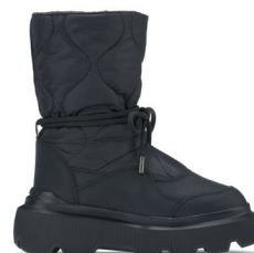
Endurance Padded Different colors available

More styles and colors — see Virtual Showroom.