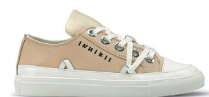
Lace Up Different colors available

More styles and colors — see Virtual Showroom.