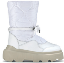
Endurance Padded Different colors available