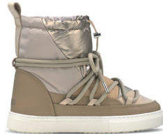
Puffer Sneakers Different colors available