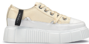
Matilda Canvas Low 23 Beige Different colors available