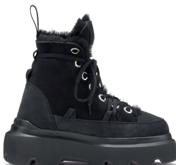
Endurance Sole Collection