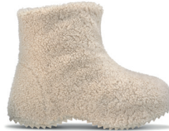
Endurance Hike Clogs Different colors available