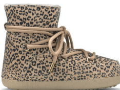
Leo Print Boots Different colors available