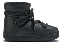
Full Leather Boots Different colors available