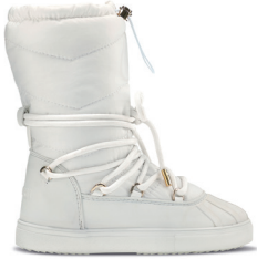
Technical High / Low Different colors available