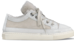
Lace-up Shearling Sneakers Different colors available