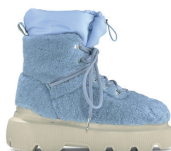
Endurance Curl Different colors available