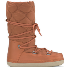
Padded Boots Different colors available