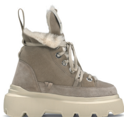
Endurance Matilda Different colors available