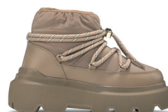
Endurance Low-Top Different colors available