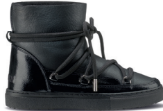
Gloss Sneakers Different colors available