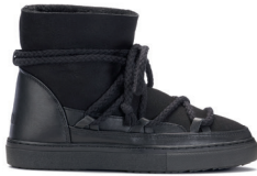
Classic Sneakers Different colors available