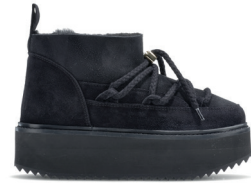
Classic Platform Sneakers Different colors available