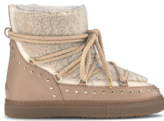
Curly Rock Sneakers Different colors available