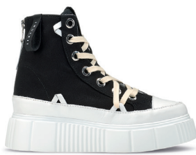
Matilda Canvas High 23 Different colors available

Levitare with our ultra-light Matilda sneaker and discover our pillars of the streets aka. our brand-new Matilda sneaker. The goal was to offer women a perfectly versatile shoe for in-between seasons. A sneaker that is the perfect companion for springtime. The feedback on our urban and feminine all-rounder sneaker Matilda Leather was overwhelming. The premium leather material and ultra-light but chunky rubber sole as well as its versatility make it so unique — you can wear it very chic or very sporty and 365 days a year.